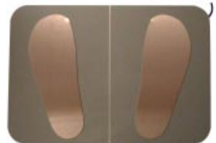
Picture: Footwear electrode for separate shoe testing (350 x 500 x 8 mm)

Optional: Wall mounting plate Part No. 7100.PGT100.101