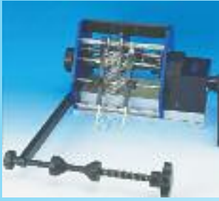
BR6 - 400200 REEL HOLDER