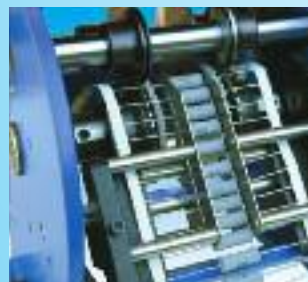
850240 COMPLETE BODY GUIDE