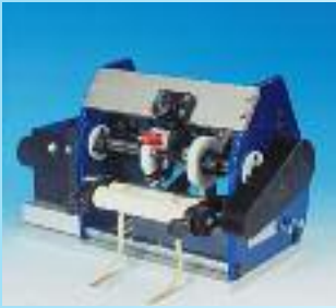
TNS - 21.0013 WASTE TAPE EJECTOR