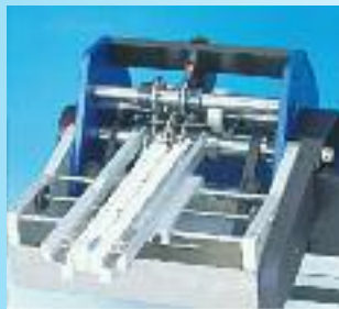
CS20 - 51.0200 FEEDER FOR LOOSE COMPONENTS