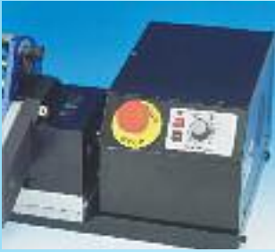
MOT98/A - 7915032 - 220 V. - MOTOR DRIVE UNIT MOT98/A - 7915033 - 110 V - MOTOR DRIVE UNIT