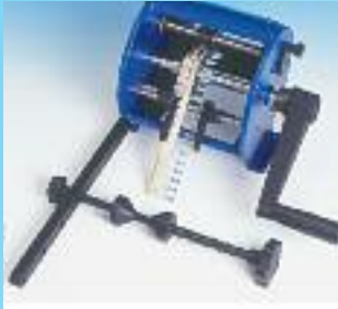
BR6 - 400200 TAPE REEL HOLDER