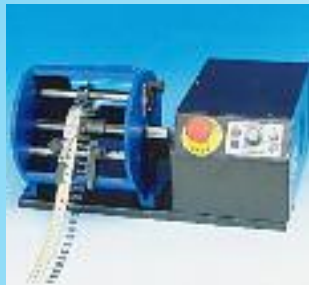
MOT98 - 7915030 - 220 V. - MOTOR DRIVE UNIT. MOT98 - 7915031 - 110 V. - MOTOR DRIVE UNIT