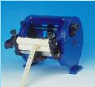
TNS - 21.0011 WASTE TAPE ROLLERS