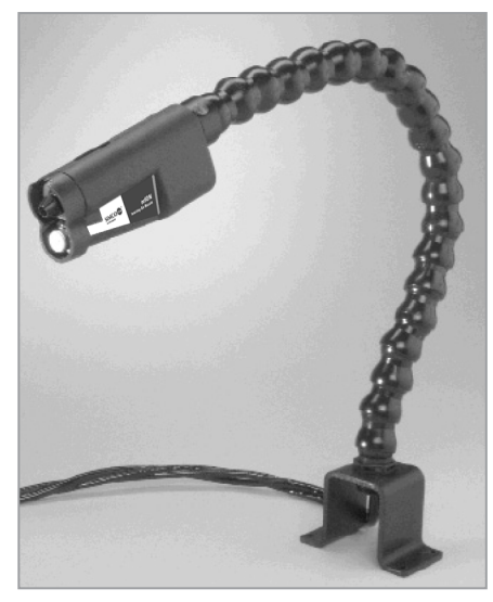
orION with Sidekick

Options include the Sidekick, flexible neck stand and a foot switch to activate the orION nozzle. The switch connects to the power supply and when depressed, activates both airflow and power to the ion emitter assembly. A red LED on the nozzle indicates power.