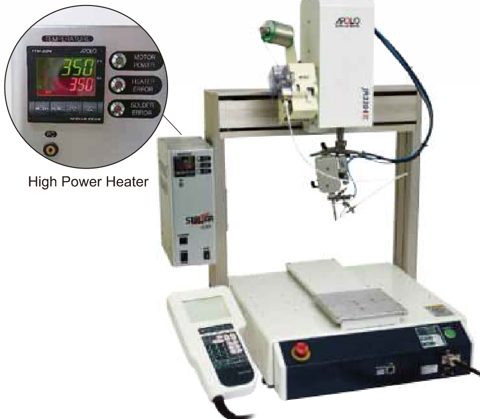
High Power Heater

This robot is the high-powered model of the J-CAT COMET. A 200 watt heater can be added as an attachment and is able to use the larger 2.0mm solder diameter. This machine is most useful in soldering high heat sink applications such as a multilayer board and shielding case.